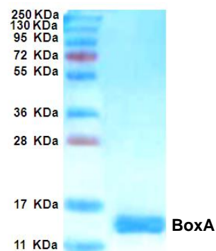
Fig. 2. 15% SDS-PAGE with Coomassie Blue staining